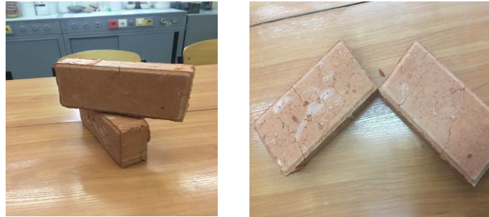
Figure 4. Samples of ceramic pavers based on the raw clay composition are talc rock.

samples had minor cracks, which can be easily eliminated by regulating the drying and firing of ceramic raw materials.