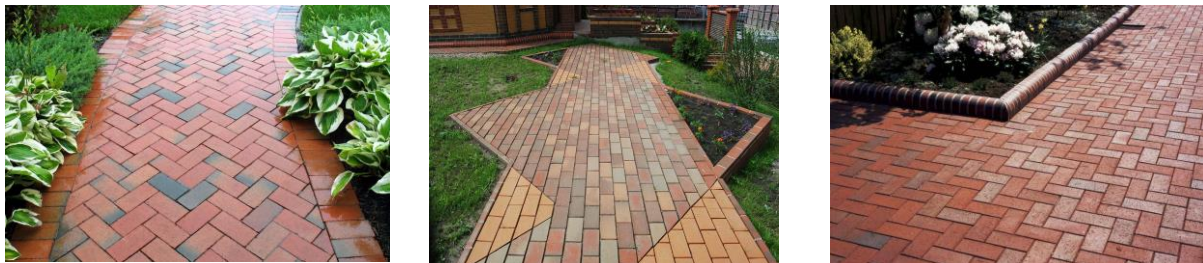
Figure 2. Fragments of sidewalks made of ceramic pavers and tiles.

It is well known that ceramic materials have high chemical resistance (98 - 99%) in relation to solutions of salts, acids and alkalis. Due to this property, the products are not destroyed by the action of sulfate salts, acids and alkalis and also have a more aesthetic appearance. (Figure 2)