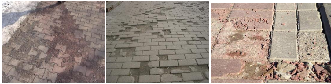
Figure 1. Fragments of the destruction of sidewalks made of concrete paving stones.

The fact is, concrete paving stones are necessarily exposed to the actions of sulfate salts of acids and alkalis, since they are necessarily present in the soil of the laid surface and are additionally exposed to chemicals from the external environment (rain, automobile oils, groundwater, etc.). Under the influence of these chemicals, concrete pavers and products made on the basis of cement binders undergo corrosion, as a result of which they are destroyed over time.