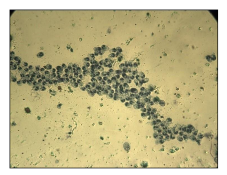
Figure 2. Myxobolus musculi from compressed fish tissue.

Thus, the extensity of parasite invasion for the studied fish has ranged from 0.4% to 97%. M. musculi microsporidia cause microsporidiosis, a widespread fish disease. Regarding the present research, they have been recovered from R. caspicus , A. gueldenstaedtii , and A. stellatus (Figure 2). This is in line with the findings of Mamedova (2009). However, the author just claims the presence of the fish species among those experimentally caught in the Caspian Sea between 2002 and 2006, also giving a list of parasite species (including M. musculi ) discovered in the fish, but it is not specified which parasites were found in which fish species.