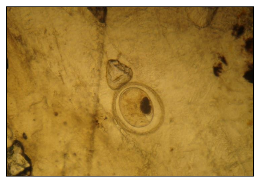
Figure 5. Opisthorchis felineus in the muscles of Leuciscus idus .

Overall, the maximum extensity of infestation (with C. rudolphii , 97%) was recorded in the population of S. volgensis . To date, no other studies were found to document the nematode in the bersh. Khasbulatova & Ataev (2019) claimed to observe Contracaecum rudolphii (Hartwich, 1964) in V. vimba inhabiting the Agrakhan Bay of the Caspian Sea. By contrast, the vimba bream was free from C. rudolphii in the present research.