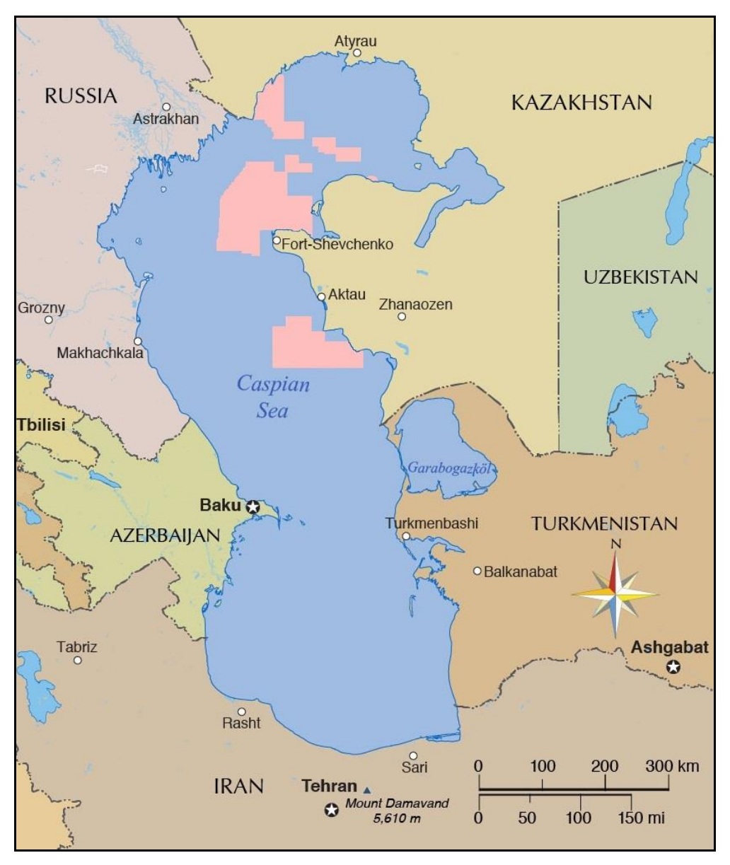
Figure 1. Study sites (in pink) in the Caspian Sea, Kazakhstan.

Description of the study sites . This investigation was carried out from 2008 to 2017 in the Kazakhstan sector of the Caspian Sea (Figure 1). Research expeditions with scientists from the Republican Veterinary Laboratory (Nur-Sultan), National Center for Monitoring, Referencing, Laboratory Diagnostics and Methodology in Veterinary Medicine (Nur-Sultan), Kazakh Research Institute of Fisheries Fishery (Almaty), Saken Seifullin Kazakh Agrotechnical University (Nur-Sultan), Zhangir khan West Kazakhstan Agrarian Technical University (Uralsk), and Kazakh National Agrarian University (Almaty) were conducted.