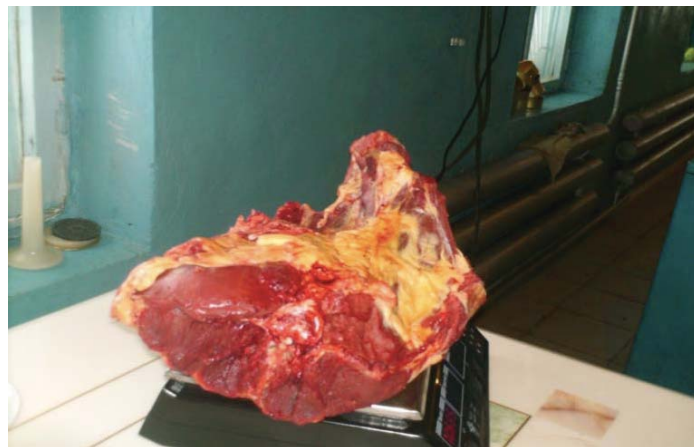
Figure 3. HCV Distribution by Genotype