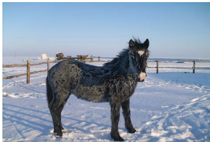
Figure 2. Mixed Young 18 Months of Age