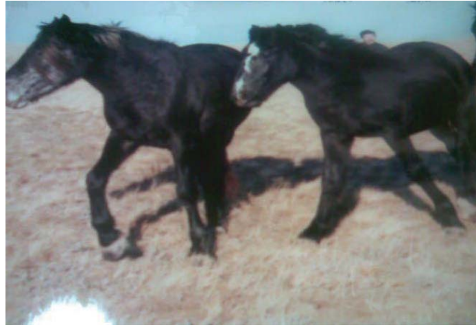
Figure 1. Mixed Young 7 Months Before Slaughter