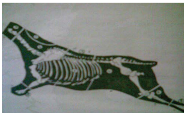
Figure 1. Diagram of Cut Carcasses of Horse (PCT of Kazakh SSR 725-72)

Lines cut off desperately relating to the third class, passes between the occipital bone and the first cervical vertebra, the posterior border of the desperate cut is between the 2nd and 3rd cervical vertebrae. The front of the shank is separated by the line through the middle of the ulna and radius, the Shin part of the lower half of the elbow and the lower half of the radial bone and wrist. The shank is separated across the back of the tibia at the level of 2 cm above the Achilles tendon. The rear shank includes the lower half of the tibia and hock.