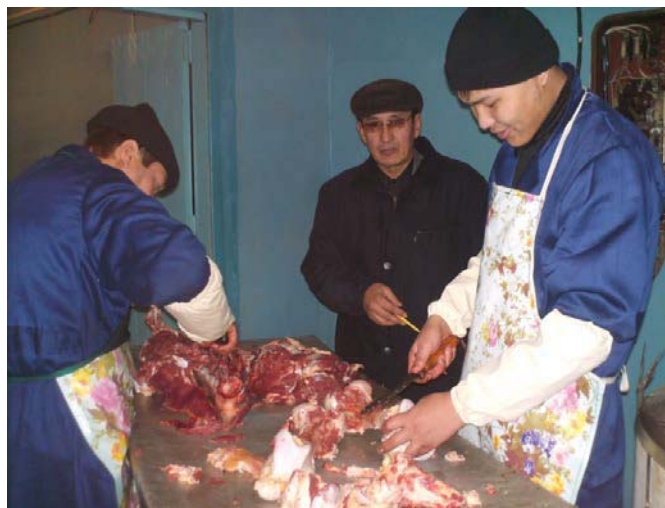
Figure 4. Deboning Carcasses of Young Animals